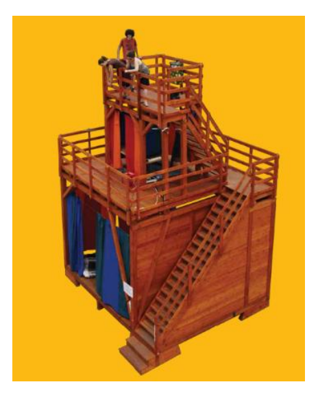
3. Figure One of the pieces of eye candy, which was made by the Social Cooperative at Pécs (2010)

The concept and spectacle of the Magic Garden-Street Ball series taking place in different squares of the city, such as Jókai Square, was created by the Mediator Association. The Pécs Cultural Center considered this work as a reference and asked the association to "enchant the space" at the Heritage Factory festival, which was organized at the Zsolnay factory. All this was done by light painting, with the involvement of Retextil Manufactory, and it was done with for example the creative usage of materials (insulation elements, which were found on the factory site).